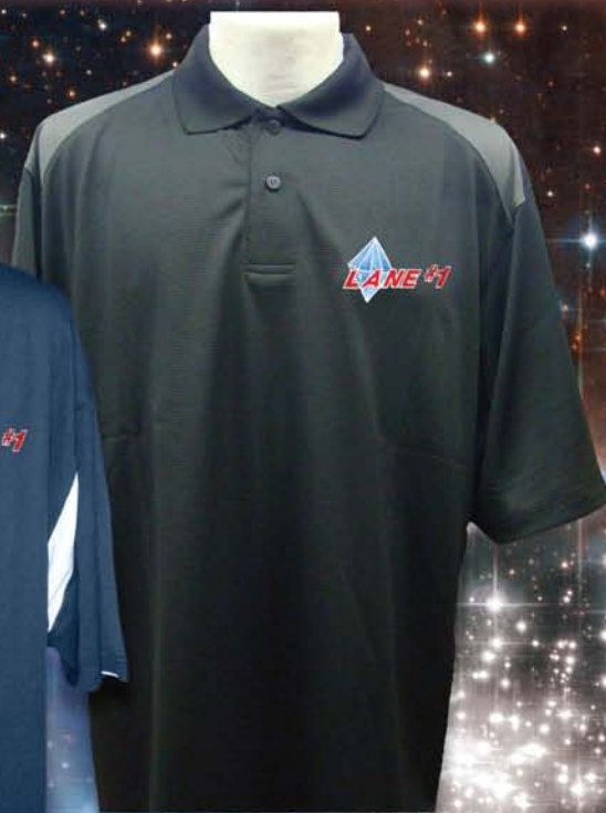
LANE #1 POLO 100% Polyester COLOR: Black SIZES: Medium-3x