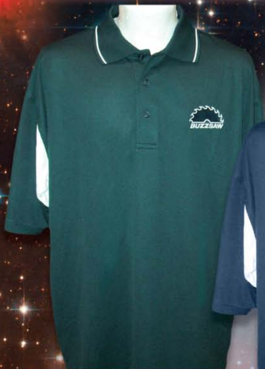
BUZZSAW POLO 100% Polyester Wicking Fabric COLOR: Forest Green SIZES: Medium-3x