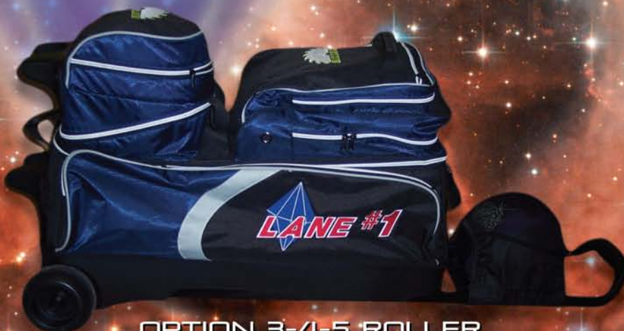
OPTION 3-4-5 ROLLER