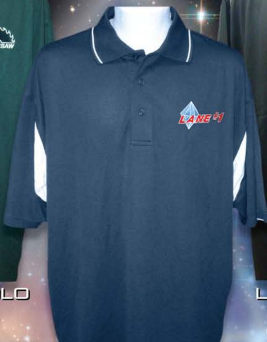
LANE #1 POLO 100% Polyester Wicking Fabric COLOR: Navy Blue SIZES: Medium-3x